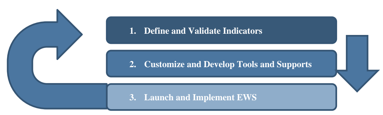
Exhibit 2. State Process for Implementing Early Warning Systems

States seeking to create a statewide early warning system typically follow three distinct steps: (1) identify or validate early warning system indicators, (2) customize and develop tools to support districts and schools, and (3) encourage and support early warning system implementation (see Exhibit 2). The following sections describe state-level strategies and lessons learned based on observations from AIR's work with seven SEAs.