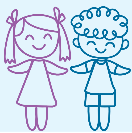
Percentage of six-year-olds saying who is better at...

By age 6, kids think that boys are better than girls at computing and engineering (but not math)